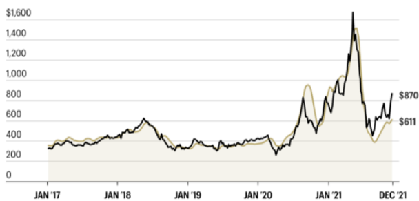
CHART: LANCE LAMBERT • SOURCE: FASTMARKETS RANDOM LENGTHS FRAMING LUMBER COMPOSITE PRICE; NASDAQ'S FUTURE PRICE FORTUNE

Building material prices fluctuate - often by a lot!