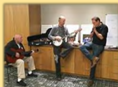
Jamming with life-long friends at St. Luke's in MN My 1 st mission trip to KY began here 25 years ago!